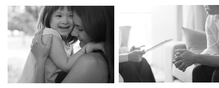
Expanding programming and inclusivity for thousands of children with special needs